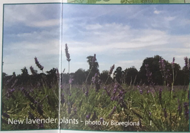
New lavender plants